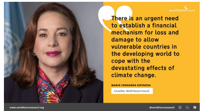
Maria Fernanda Espinosa, President of the 73 rd UN General Assembly