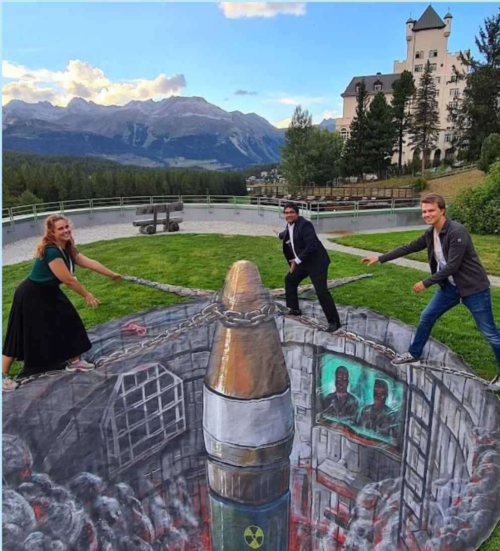
Photo: Basel Peace Office runs the #3DNukeMissile, an inter-active educational experience, in Pontresina, Switzerland in conjunction with the World Ethics Forum and the World Future Council Annual Meeting.

Basel Peace Office is established to advance research, teaching and policy-development programs dedicated to international peace, conflict resolution and security to achieve the global abolition of nuclear weapons.