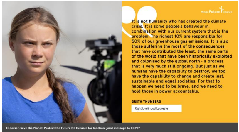
Greta Thunberg, endorser of Save the Planet, Protect the Future; No Excuses for Inaction

Alyn facilitated the drafting of Save the Planet: Protect the Future / No Excuses for Inaction , an environmental action statement endorsed by Right Livelihood Laureates and Members of the World Future Council. Alyn also organized the presentation of the statement to the Stockholm+50 conference in June and to COP27 in Egypt in November 2022.