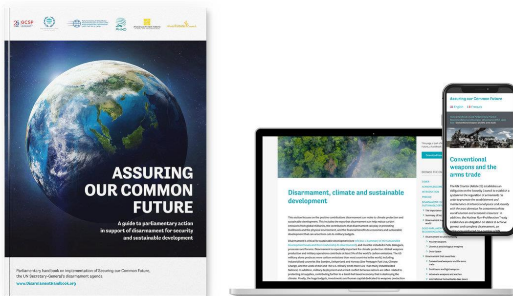
Assuring our Common Future: the online parliamentary handbook on disarmament for security and sustainable development. Available in English and French .