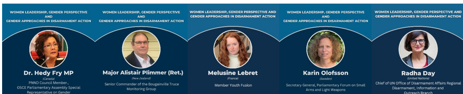
Some of the speakers at the event we organised on Dec 1 on Women's Leadership and Gender Approaches