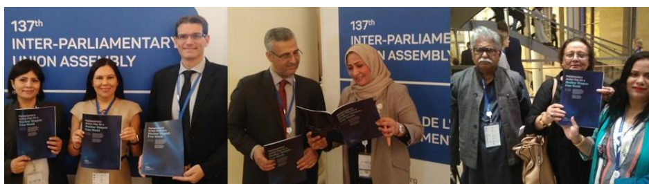
PNND members and volunteer staff at the release of the Parliamentary Action Plan in St Petersburg

We supported our PNND members around the world who took action on a number of issues outlined in the action plan, including de-alerting, no-first-use, the Iran deal, the treaty to prohibit nuclear weapons, reducing nuclear weapons spending, and promoting nuclear-weapon-free zones. To help facilitate this work we produced a PNND electronic update approximately every two weeks and distributed this to over 1000 parliamentarians and about 800 representatives of non-governmental organisations.