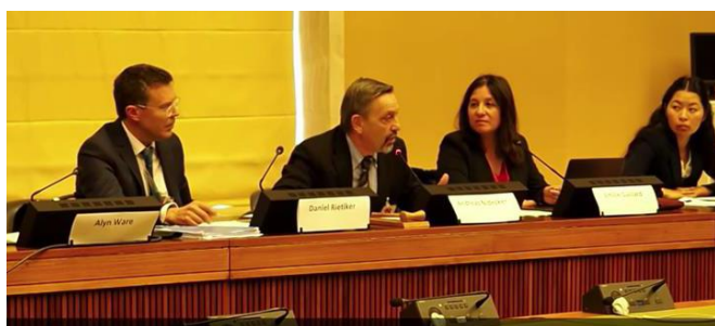
Speakers at the May 1 panel on Nuclear Weapons, Law, Human Rights and Future Generations.