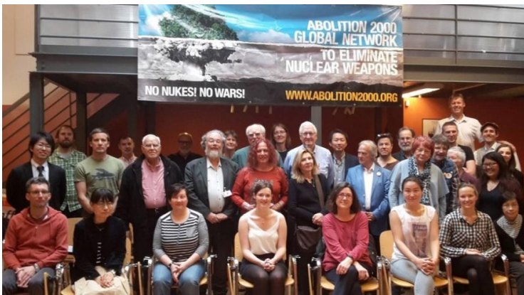
Some of the participants in the Abolition 2000 AGM in Geneva

In addition, we maintained the Abolition 2000 global calendar of nuclear disarmament events.