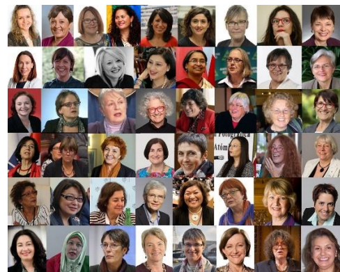
Endorsers of the joint statement of women legislators

PNND work for 2018 was guided by the Parliamentary Action Plan for a Nuclear-Weapon-Free World which we produced in cooperation with the Inter-Parliamentary Union (IPU) and the OSCE Parliamentary Assembly.