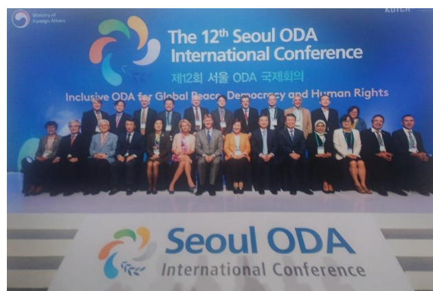
BPO Director is keynote speaker at Seoul conference on peace and development in Korea

This included coordinating an Appeal from Abolition 2000 members for a diplomatic solution in North East Asia , organizing parliamentary events in Tokyo and Seoul, organizing a diplomatic event in New York co-sponsored by the ROK Mission to the UN, and being invited to be a keynote speaker at a number of events on the issue including the Korea Peace Forum in New York and at an ROK government hosted conference in Seoul on the issue (speaking after the Deputy-Foreign Minister).