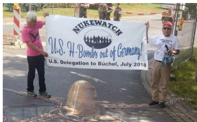
#3D Nuke Missile at Büchel weapons base