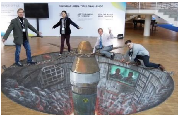
#3D Nuke Missile at the Basel Peace Forum

The #3dNukeMissile is an interactive art piece depicting a nuclear missile about to be fired. Members of the public are invited to have their photo taken (with their cell phone or camera) while they stand on the art work holding the chains to stop the missile launching. They can then post their photo on twitter, facebook etc with the hashtag #3dNukeMissile. In 2018 we used the #3dNukeMissile at the Basel Peace Forum, the Buechel nuclear weapons base in Germany, and at public events in another 4 German cities (Stuttgart, Aalen, Cochem and Nettetal-Breyell), mostly in conjunction with Mayors for Peace Germany.