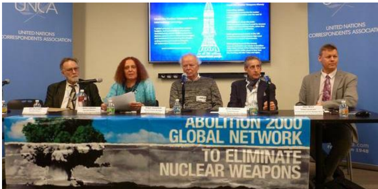
UN press conference to launch the online platform and announce Count the Nuclear Weapons Money